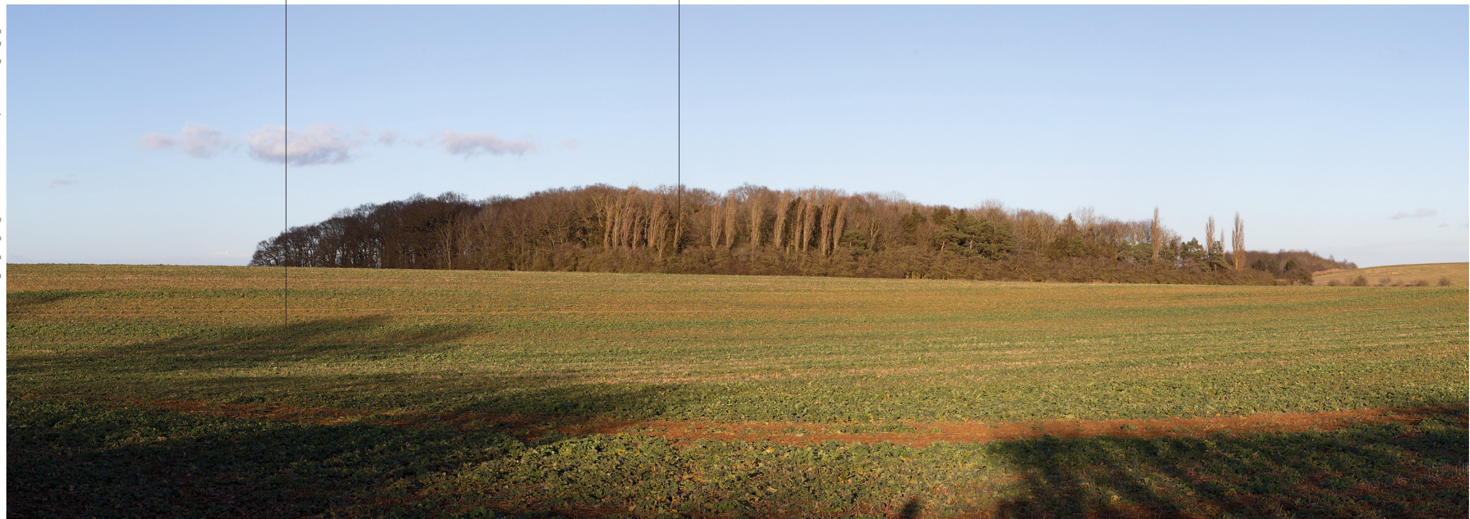
Representative Viewpoint 12 (Left-Centre) - Field access at junction of Bridleway E169 with B1176 to north of Ryhall village

Quality Assured to BS EN ISO 9001:2008